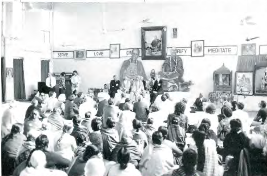
Participants visit the site of the New Delhi temple of IRFWP President Swami Chidananda.