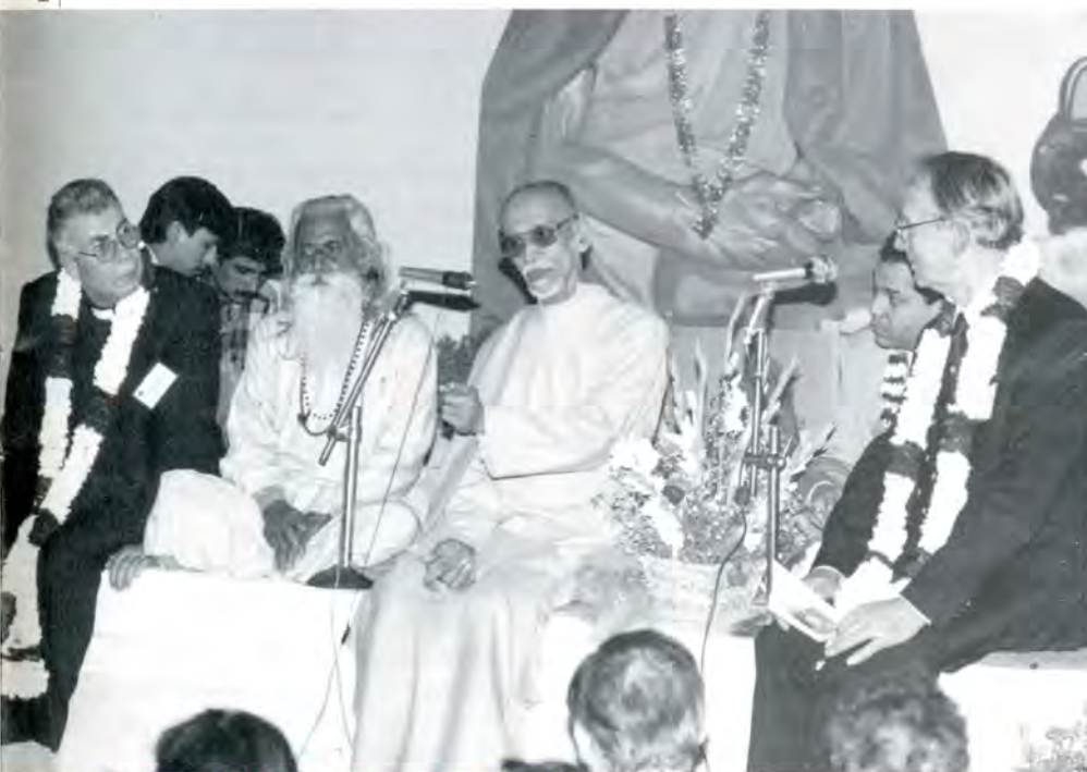
Peace pervaded the pilgrims in the temple.

The messages from both Mrs. Sharma and Mrs. Gandhi were read at the February 4 plenary on "Women, Religion and World Peace." The first lady of India urged women to take on the task of creating religious harmony. "Women have a vital role to play," she said. "The influence they exert in the family, through their own conduct and character, can play a crucial role in molding the all-important virtues of tolerance, acceptance, and mutual respect, which enable people to