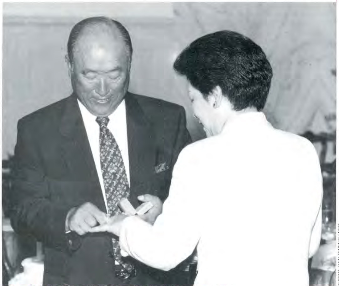
Father gives Mother a ring (l.) and Mother gives Father a watch (r.)

First, there was Adam, the second Adam was Jesus, and the third Adam is Sun Myung Moon. The people who opposed me are beginning to feel shaky; they are not so confident in their