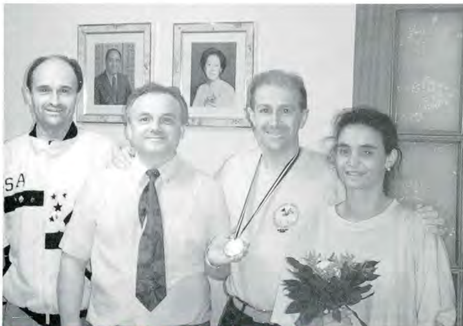
Enjoying the moment with the volunteers he witnessed to.

During that time my spiritual children came to see me from Germany and Switzerland. When the team members saw