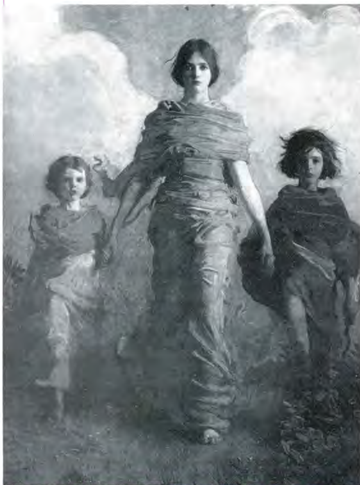
If Mary and Elizabeth had become one and Jesus and John had become one, they would have protected Jesus, and he would not have been killed.

Women fell and they lost God and True Parents, too. Now it is up to them to restore God and True Parents. Women must love even the people of the satanic world as if they were their husband or father or mother. The movement to accomplish that is the Women's Federation for World Peace. When a woman