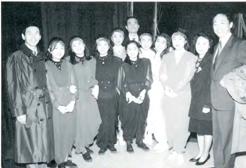
Second generation Belvedere Sunday school sisters pose with some of their parents after performing a joyful dance for True Parents at Parents' Day entertainment at the Manhattan Center.

History has advanced from the feudal ages to two blocs and now to one huge bloc. The Unification Church is sitting on top of that, understanding it all. All racial, economic and national problems can be transcended with the almighty power of love. Our holy weddings are the direct implementation of this. No other religion does this. Interracial marriage goes beyond all cultural, racial and national problems. Are there many white people who would like a black spouse? No, but in the Unification Church, even though the bride and groom have never seen each other and cannot even talk to each other, they are happy with Father's choice. The world looks at that and fiercely opposes it at the beginning. As time goes on they will not oppose so much. It is a shock